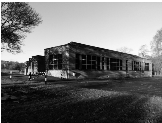
The former Hobkirk Primary School